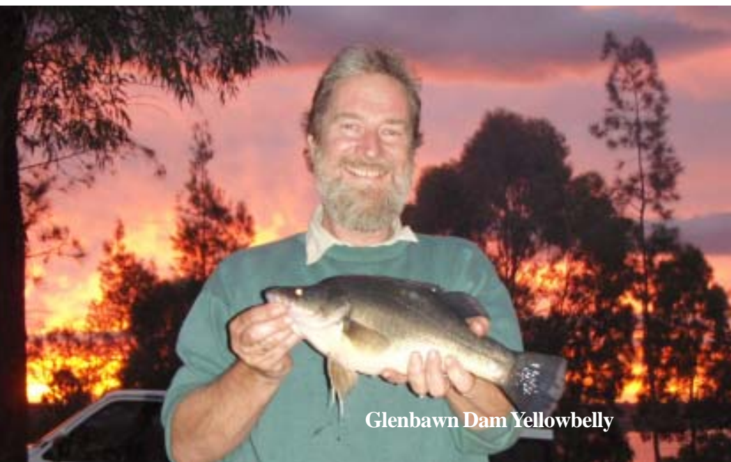
Glenbawn Dam Yellowbelly