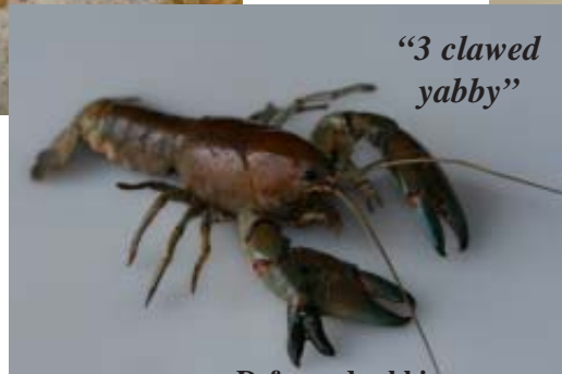
"3 clawed yabby"

We have been fishing for native fish to add a bit of fun to the surveying and have been doing quite well. Mostly golden perch (Yellowbelly) and though we have tried to catch a Murray Cod we have not been successful lately. Lots of carp still about and though they give a good fight they are not much good for anything else except yabby bait.