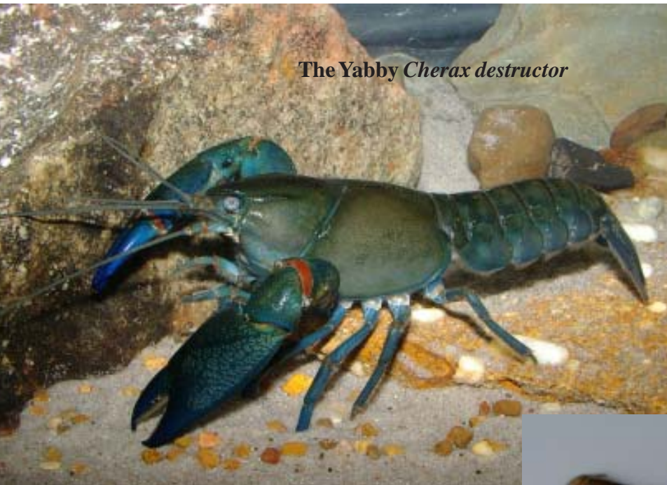
The Yabby Cherax destructor

Once you get inland onto the western draining streams of NSW you are into Cherax destructor country and these are the primary species out west. That said there are quite a few species at the start of western drainage in the mountain streams and we have been investigating these species over the last few months. We have also been further west doing a bit of surveying and also recreational fishing at some of the larger dams and rivers. We make camp on the dam or river then use that campsite as our base to radiate out surveying streams. We are collecting specimens of Cherax destructor from across Australia and though they are all the same species there is considerable morphological variation between the different local/regional populations.